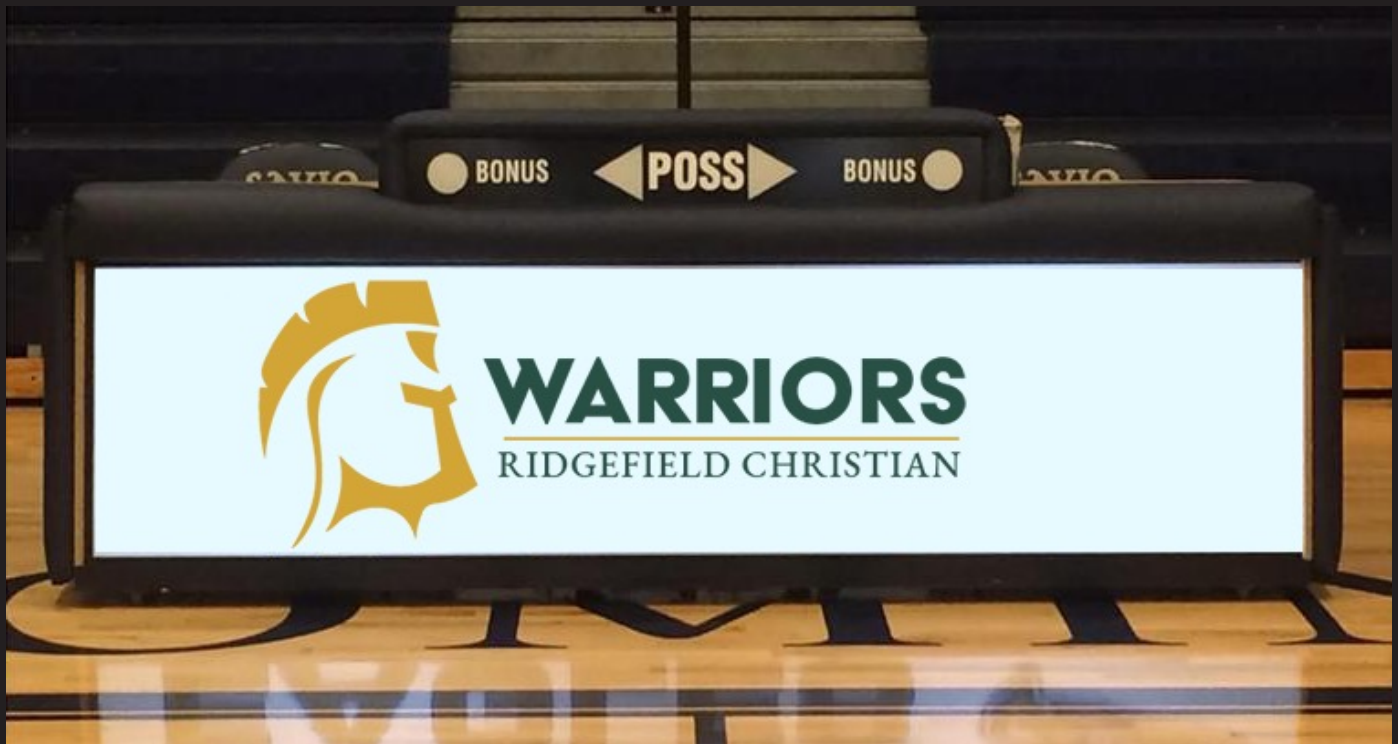
Pro LED 10' digital scorers' table from Sideline Interactive

As a supporter of Warrior Athletics, your business, church, or organization can sponsor RCS for a full season, a single game (or 2), concessions, or even select specialty sponsorships within the game itself. Featuring high-quality, eye-catching digital ads on the 10' wide LED screen in different styles and sizes, there's an option for every budget.